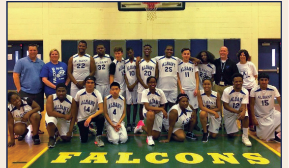
Albany High's newest team, unified basketball, fared well its rookie season.

"They're a very talented group of kids," she said of her teammates. "I'm the one who's not very athletic – I'm in the school