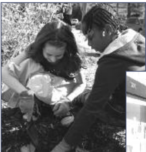
The City School District of Albany's annual budget supports a wide range of programs and services for all students, from full-day prekindergarten through high school.

Board members agreed on the plan after months of efforts to reduce a deficit of more than $10 million resulting from declining state aid and increases in salaries, benefits and charter-school